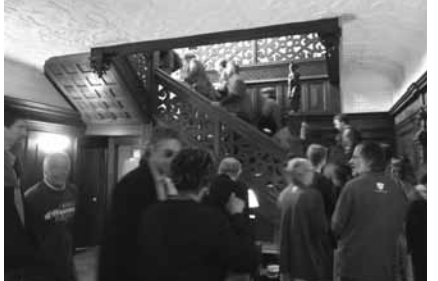
Marching into the President's office

inside filled the lobby, the stairs and the upper hallway.